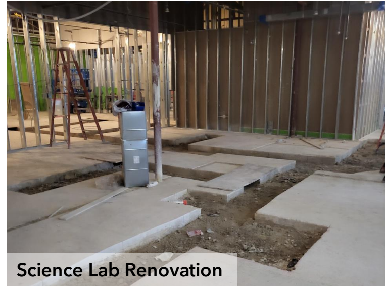
Science Lab Renovation