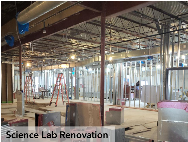
Science Lab Renovation